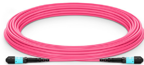
MPO/MTP Fiber Patch Cords