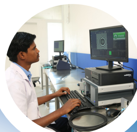
Optical Insertion & Return Loss Testing