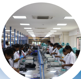
Fiber & Copper Assembly Lines

Located at Chennai, HTL has a fully integrated passive components facility for design, engineering & manufacturing of an entire gamut of passive components for Central Office, Outside Plant, Fiber to the Home, Local Area Networks, Security Surveillance and Data Center Cabling applications.