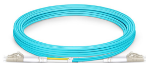
Fiber Patch Cords

HTL's fiber & copper cabling solutions are easy to install, future ready with minimum installation and reduce time spent on sites as well as operating costs.