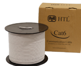
Structured Cabling Solutions