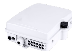
Fiber Access Termination Boxes