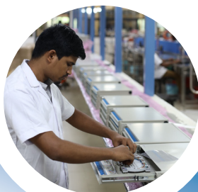
Fiber Splice Tray Routing