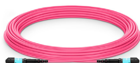
MPO/MTP Fiber Patch Cords