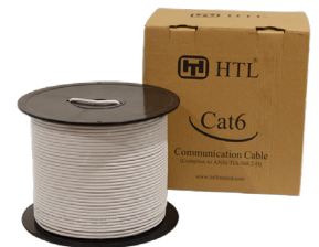
Structured Cabling Solutions