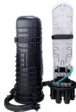
Fiber Splice Joint Closures