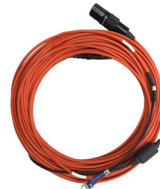
FTTA Cable Assemblies