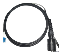
FTTA Cable Assemblies