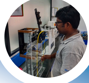
Quality & Testing Lab