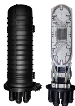
Fiber Splice Joint Closures