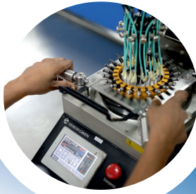
Polishing for Fiber Connectors