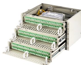
Fiber Distribution Management Systems