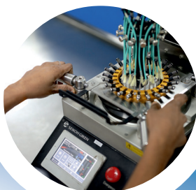
Polishing for Fiber Connectors