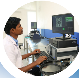
Optical Insertion & Return Loss Testing