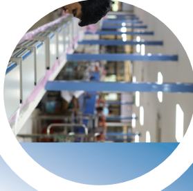
Fiber Splice Tray Routing