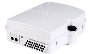
Fiber Access Termination Boxes