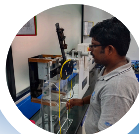
Quality & Testing Lab