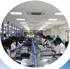
Fiber & Copper Assembly Lines

Located at Chennai, HTL has a fully integrated passive components facility for design, engineering & manufacturing of an entire gamut of passive components for Central Office, Outside Plant, Fiber to the Home, Local Area Networks, Security Surveillance and Data Center Cabling applications.